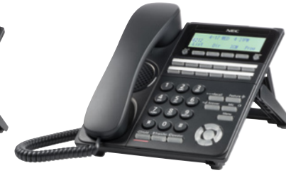
DT920 12 button