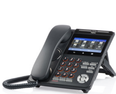
DT930 Touch Panel