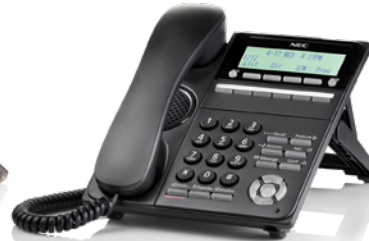
DT510 6 button