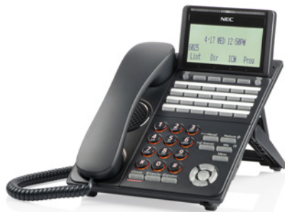
DT530 24 button