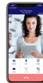
ST500 Mobile Client

*Handsets may have regional availability - check with your NEC reseller for further details