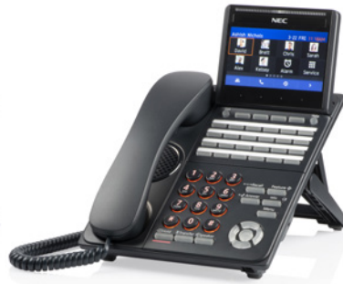
DT930 24 button